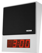
VIP-411-DS One-Way Wall Mount IP Speaker Gray w/ Black Grille, w/ Digital Clock