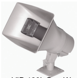
VIP-130L One-Way 5-Watt High Efficiency IP Horn w/Long Line Extender (BG) Beige (GY) Gray (M) Marine