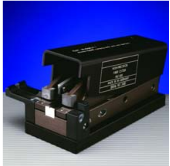
FBC-005 Fiber Cleaver | Photo HWPSS928

This cleaver consistently provides cuts averaging less than 0.5^\circ from perpendicular with 95 percent less than 1^\circ . With superior reliability, this field cleaver offers laboratory quality and performance. Featuring unrivaled durability and dependability for manufacturing, the cleaver's simple, one-step operation makes it easy to use.