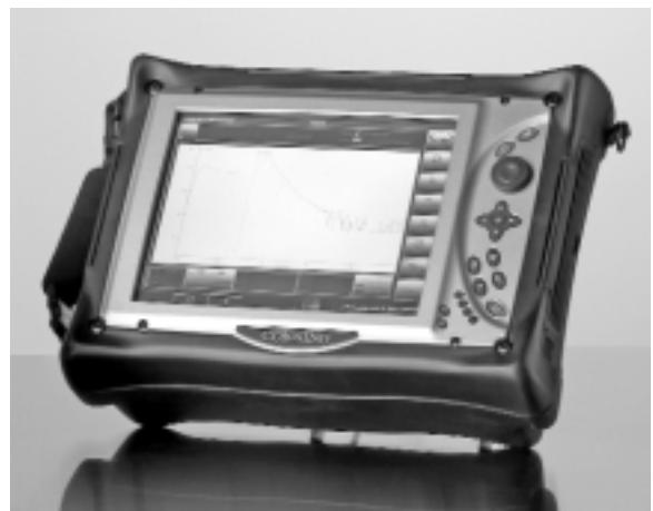
Model 500 Optical Multitester | Photo LAN681