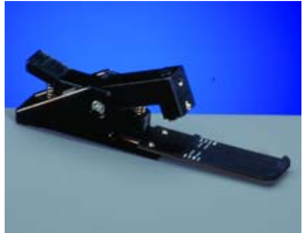
FBC-001 Fiber Cleaver | Photo SEH131

The least expensive of all Corning Cable Systems cleavers, the FBC-001 is adequate ( \leq 2^\circ ) for cleaving fiber ends for OTDR access (through a lab splice or XYZ stage), multimode and single-mode mechanical splicing, and UniCam® Connector installation.