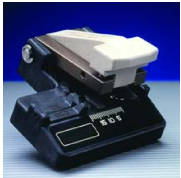
FBC-006 | Photo FSP551292

This cleaver provides smooth, flat, perpendicular fiber end-faces (typically < 0.7^\circ ) necessary for low-loss fusion or mechanical splicing. Fast and easy to use, it produces high-quality, repeatable cleaves for multimode and single-mode fibers in one simple step. The unit cleaves all 250 \mu\text{m} coated fibers and 900 \mu\text{m} buffered fibers.