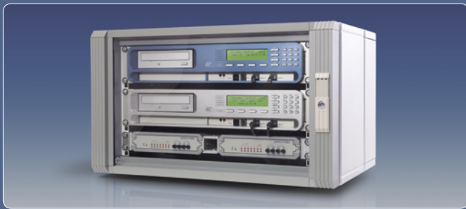
Vidicode Fax Server PRI built into a 19" rack in combination with Vidicode Call Recorder PRI.

Vidicode Fax Servers Quarto, Octo and PRI are scalable solutions for larger organizations with several fax lines and that wish to centralize and structure their fax communications.