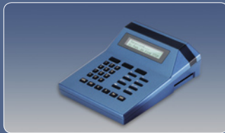
Vidicode Fax Server I

Vidicode Fax Server I is the perfect solution for small organizations that have a single fax line but have outgrown the traditional fax machine and seek a network solution.