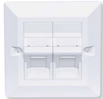
EBM1 frame with 2 EAM1S modules.