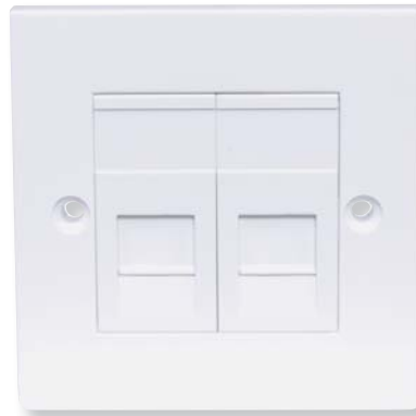
EMBPI frame with 2 EM1S modules.

Hubbell's international frames, plates and modules provide angled and flat shuttered configurations compatible with standard international style back boxes and floor boxes. These attractive plates deliver field-configurable mounting for HPW's extensive line of Ascent and XCELERATOR™ series jacks.