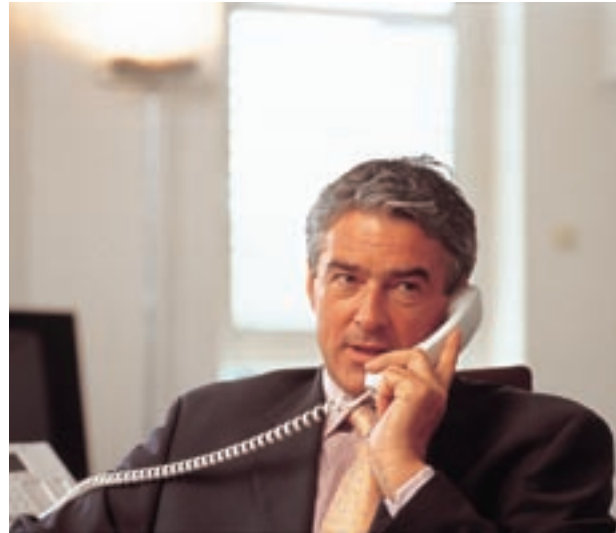
Calls can be directed to a specific individual,

To insure you are leveraging all of the advantages and cost benefits of your network the system software can automatically route calls to their destination using the least expensive path.