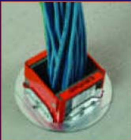
EZ-Path™ Floor Installation

EZ-Path™ eliminates these problems. From installation (empty) to 100% visual fill it remains fire and smoke compliant... 100% of the time.