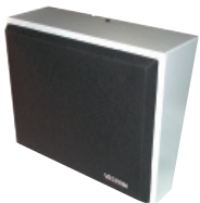
VIP-410 One-Way Wall IP Speaker Gray w/ Black Grille, Paintable Body