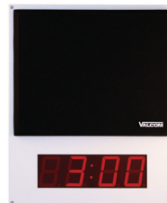
VIP-412-DF One-Way Flush Mount IP Speaker Gray w/ Black Grille, w/ Digital Clock