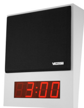
VIP-411-DS One-Way Wall Mount IP Speaker Gray w/ Black Grille, w/ Digital Clock