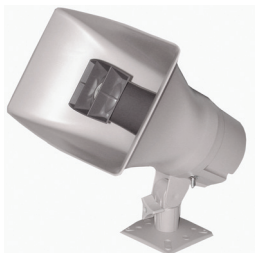
VIP-130L One-Way 5-Watt High Efficiency IP Horn w/Long Line Extender (BG) Beige (GY) Gray (M) Marine