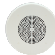
VIP-120 One-Way 8" Round Ceiling IP Speaker