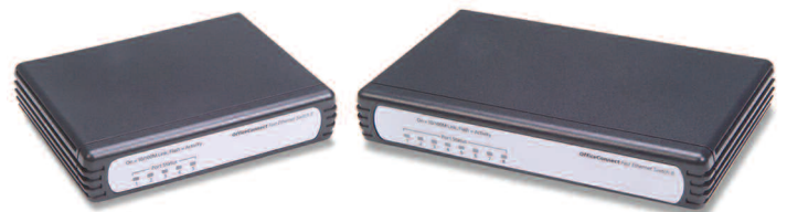
left to right: OfficeConnect Fast Ethernet Switch 5 and Switch 8

Silent operation. Self-cooling fanless design ensures there is no noise disturbance from the switches.