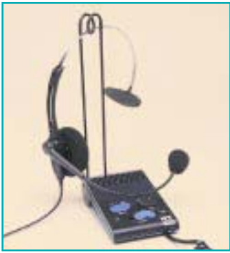
The HT-Two (shown here with headset stand and ADDvantage Plus headset) is the perfect choice for high-volume outbound call centers with predictive, preview and/or progressive dialing capabilities.

The HT-Two is designed to work with any GN Netcom brand headset. For high-volume call center use, we recommend using the following models: