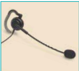
The Profile SureFit gives you three models (405, 405-FLEX and 405-UNC) to choose from, each with three interchangeable wearing styles—flexible earhook, earloop and headband.