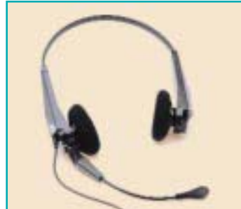
The Orator-G's unique features, like its swing-away microphone boom, add up to a dramatic new level of comfort, stability and performance. (Monaural model also available.)