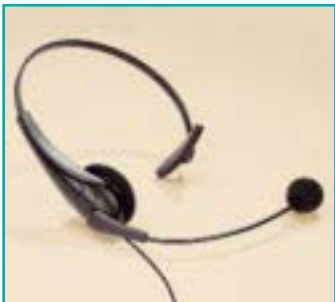
The Optima-G delivers great sound and a sleek, ergonomic design plus surprising affordability. (Binaural model also available.)