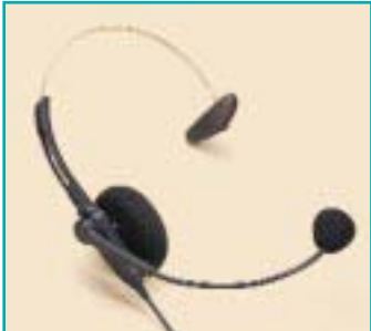
The ADDvantage Plus has become the call center standard, with its combination of great sound, lasting comfort and exceptional durability. (Binaural model also available.)

The HT-Two is designed to work with any GN Netcom brand headset. For high-volume call center use, we recommend using the following models: