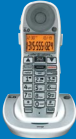
29110AE1 ACCESSORY HANDSET