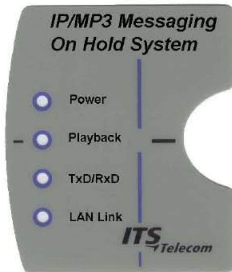
Figure 1-2: Indicators

The front view shows a number of indicators, which have been described below.