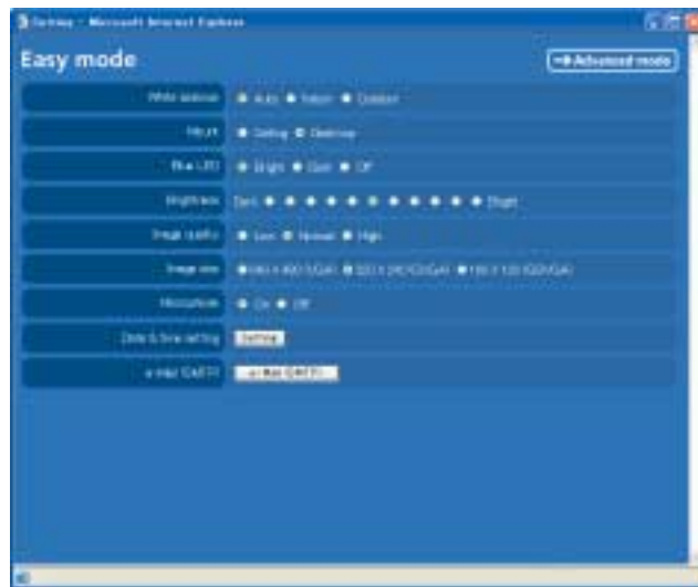
Setup Viewer: Easy mode

Settings can be easily adjusted using a user-friendly GUI on the PC monitor.