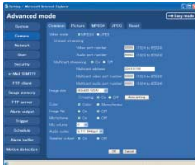
Setup Viewer: Advanced mode