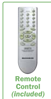
Remote Control (included)