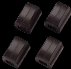
256850 NETmapper Online active network tester

The NETmapper. It is a hand-held multifunctional network-testing device that supports On-Line (Active Network) and Off-Line (Cable) Test. As an On-Line Test, it operates ping network device with IP address, and as an Off-Line Test (Cable Test), it functions as a cable checker.