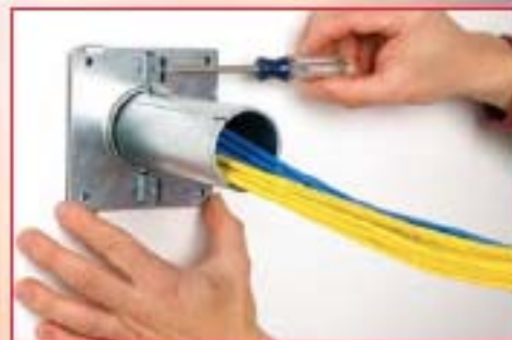
Intumescent gasket and plate assemble easily