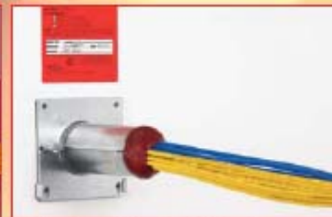
Code Compliant solution!