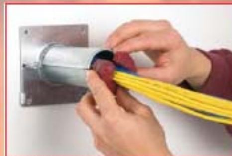
Finish the job with SpecSeal® Intumescent Firestop Putty (supplied in every kit)