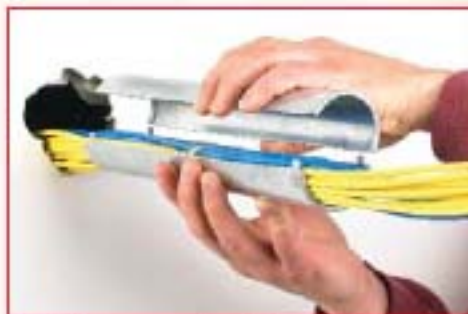
Installs around existing cables