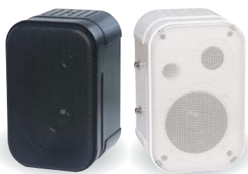
FG15B (Black) FG15W (White)