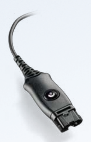
Quick Disconnect™ feature lets you walk away from your phone without removing your headset—without dropping the call.