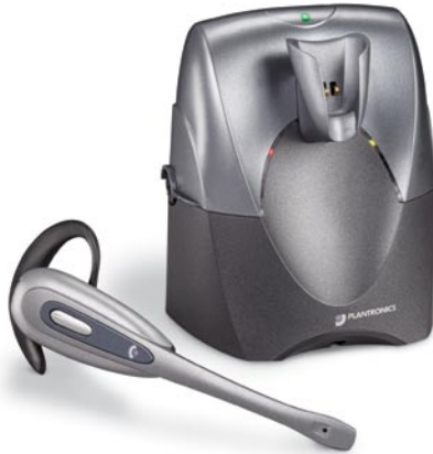
Charging cradle with IntelliStand™ feature allows user to answer, end and mute calls from the headset