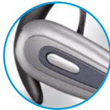
Volume up/down and mute; One-touch call answer/end