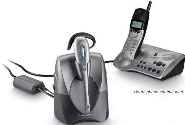
Home phone not included

Walk and talk while working at home with the Plantronics CS55H Home Edition for cordless or corded home phones. This hands-free headset transforms your home office environment by providing you with freedom of mobility, crystal clear conversations, and personalized all-day comfort — enhancing your ability to multi-task with ease.