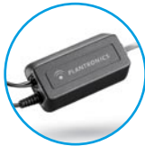
Adapter provides hook/switch control; no lifter required (two-way RJ-11 splitter also included)