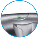
Online indicator light