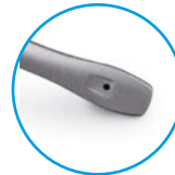
Noise canceling microphone