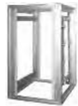
Frame Only Style