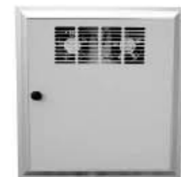
Door-mounted Rear Fan Option (replaces combined fan/power strip accessory)

800-834-4969 in US & Canada • www.chatsworth.com