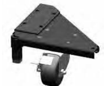
P/N 13203 shown