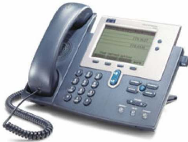
Figure 1. Cisco IP Phone 7940G

The Cisco IP Phone 7940G, a key offering in the IP Phone portfolio, addresses the communication needs of a transaction type worker. It provides two programmable line and feature keys, plus a high quality speakerphone. The Cisco IP Phone 7940G also has four dynamic soft keys that guide users through call features and functions. Built-in headset port and integrated Ethernet Switch are standard with the Cisco IP Phone 7940G. Also includes audio controls for full duplex speakerphone, handset and headset. The Cisco IP Phone 7940G also features a large, pixel-based LCD display. The display provides features such as date and time, calling party name, calling party number, and digits dialed.