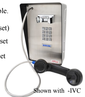
Shown with -IVC

Providing Telecommunication Solutions Since 1930