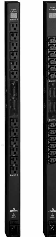
Pictured: MV121-1D1 (left), MV122-1C2 (right)

For a copy of Leviton product warranties, log on to www.levitonvoicedata.com/warranty .