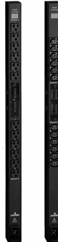
Pictured: MV121-1D1 (left), MV122-1C2 (right)

2222 - 222nd St. SE • Bothell, WA 98021 USA Tel: 1-800-722-2082 / 1-425-485-4288 • Fax: 1-425-483-5270 • Int'l Fax: 1-425-485-9170 • GSA Schedule Available.