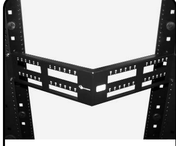
Using the #12-24 screws provided, mount the patch panel to the desired position on a 19" relay rack or equivalent.