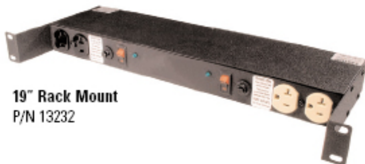
19" Rack Mount P/N 13232