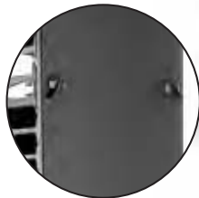
Hinged locking door