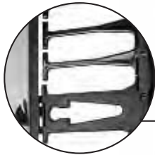
Extended fingers of CCS-EFX