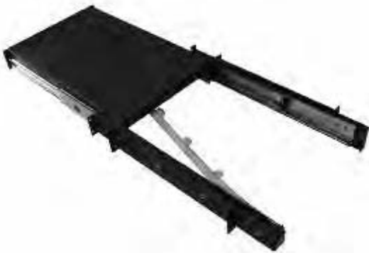
Patented shelf extends a full 24" (610 mm)