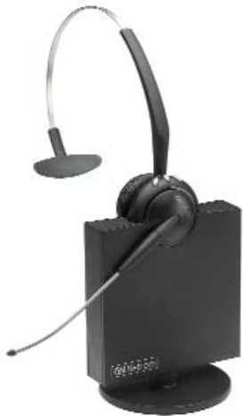
GN 9120 LR Shown with charging base and wireless headset.