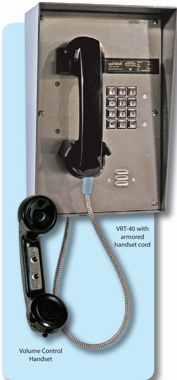
VRT-40 with armored handset cord