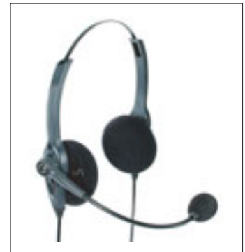
Passport 20-P Binaural