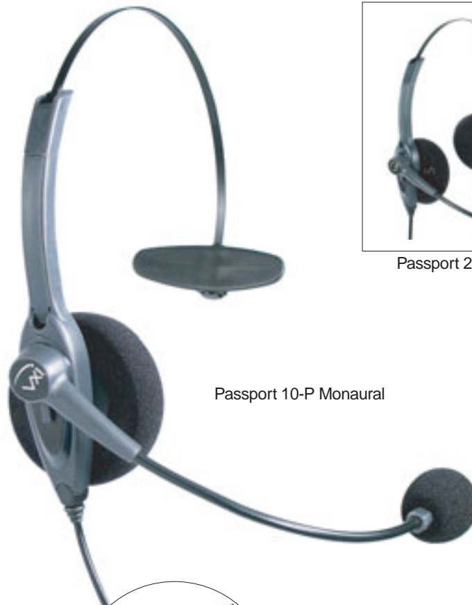
Passport 10-P Monaural