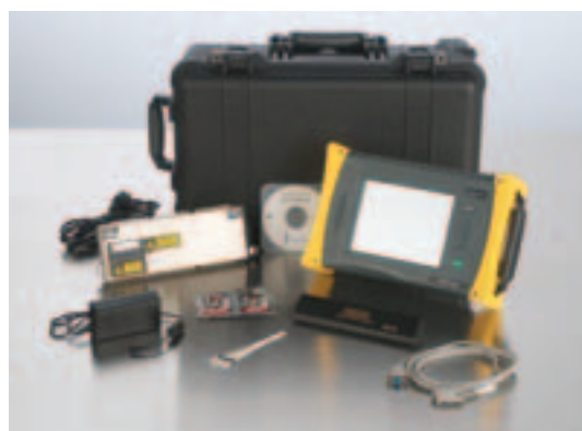
OptiVisor 400 OTDR Basic Kit | LAN638

Kits include OptiVisor 400 OTDR Mainframe with power meter, single-mode and/or multimode module with VFL, power supply, Smart NiMH battery, 9 volt battery, RS232 serial cable, CD with OTSView PC emulation software, OTSBatch PC batch processing software and user's manual, cleaning supplies, Quick Reference manual, and hard-shell transit case.