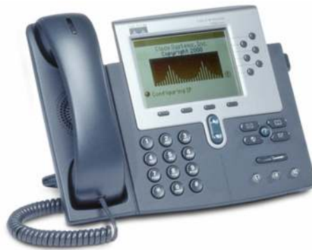
Figure 1. Cisco IP Phone 7960G

The Cisco IP Phone 7960G, a key offering in the IP Phone portfolio, is a full-featured IP phone primarily for manager and executive needs. It provides six programmable line/feature buttons and four interactive soft keys that guide a user through call features and functions. Audio controls for duplex speakerphone, handset and headset. The Cisco IP Phone 7960G also features a large, pixel-based LCD display. The display provides features such as date and time, calling party name, calling party number, and digits dialed. The graphic capability of the display allows for the inclusion of such features as XML (Extensible Markup Language) and future features.