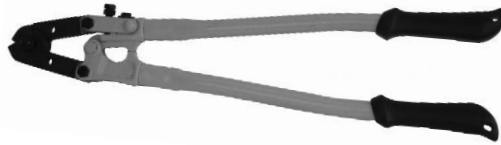
FastTrac Cable Shears