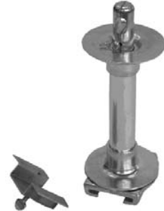
FastTrac Cable Roller and Cable Roller Bracket