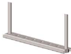
FastTrac Trapeze Support Bracket