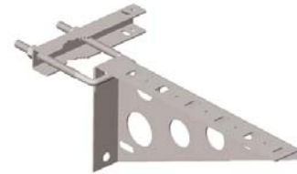
FastTrac Triangle Support Bracket and (1) FastTrac Pedestal Clamp