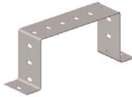
FastTrac Under Floor Support Bracket