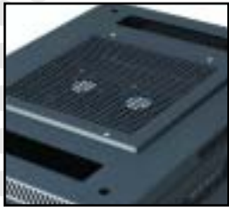
Two topside fans