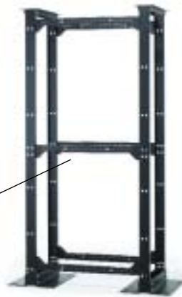
Image shown with two piece conversion kit added