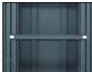
Adjustable side braces