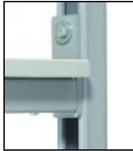
Fully adjustable upper shelving