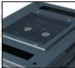
Two topside fans