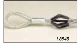
Single/Double Weave Pulling Grips are ideal for longer pull applications.

Single/Double Weave, Bale Eye, Medium Duty—Kit