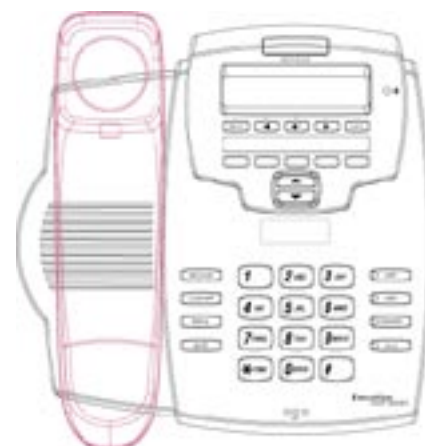
model ITC-3012 shown