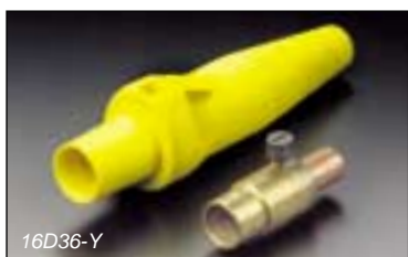
Heavy Duty Female Detachable Plug—Crimped (Cable Size: 1/0–2/0)