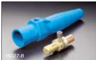
Heavy Duty Male Detachable Plug—Crimped (Cable Size: 1/0–2/0)