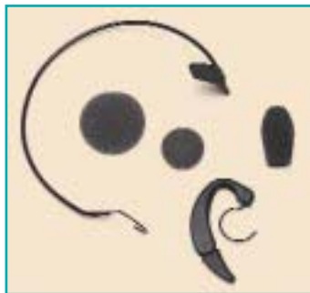
The Stratus Ultra-G comes complete with headband, ear capsule, ear cushions and windscreen.

There's a GN Netcom amplifier for every need and every application. Like our headsets, all GN Netcom amplifiers feature a two-year warranty.