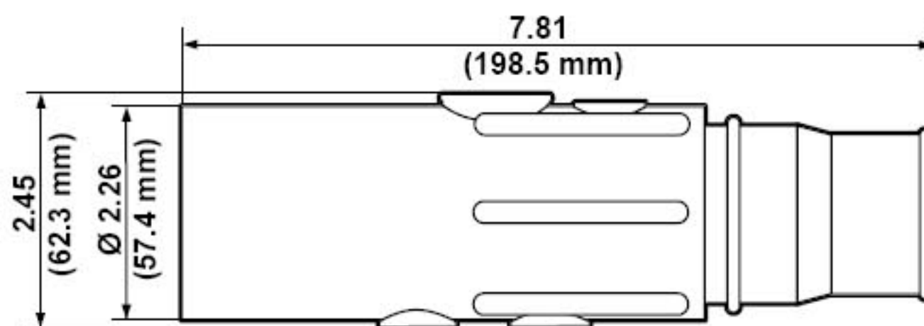
BALL NOSE IN-LINE LATCHING MALE CONNECTORS—CRIMPED Cat. No. 22L21