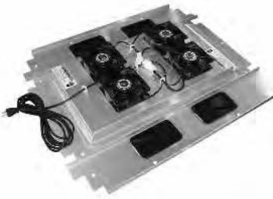
12511-50X Air Filter Kit with Fans

Note: This product only available for 30"D (760 mm) MegaFrame Cabinets. Unit will generate 48 db noise level.