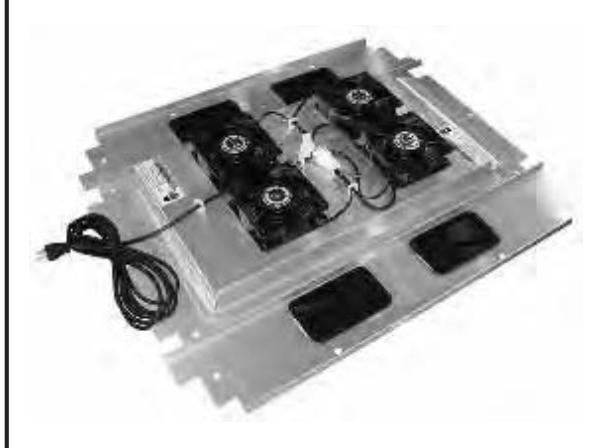
12511-50X Air Filter Kit with Fans