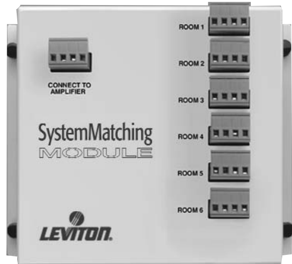
Cat. No. SGAMP-000