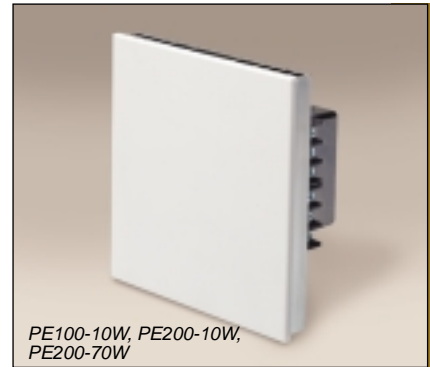
PE100-10W, PE200-10W, PE200-70W