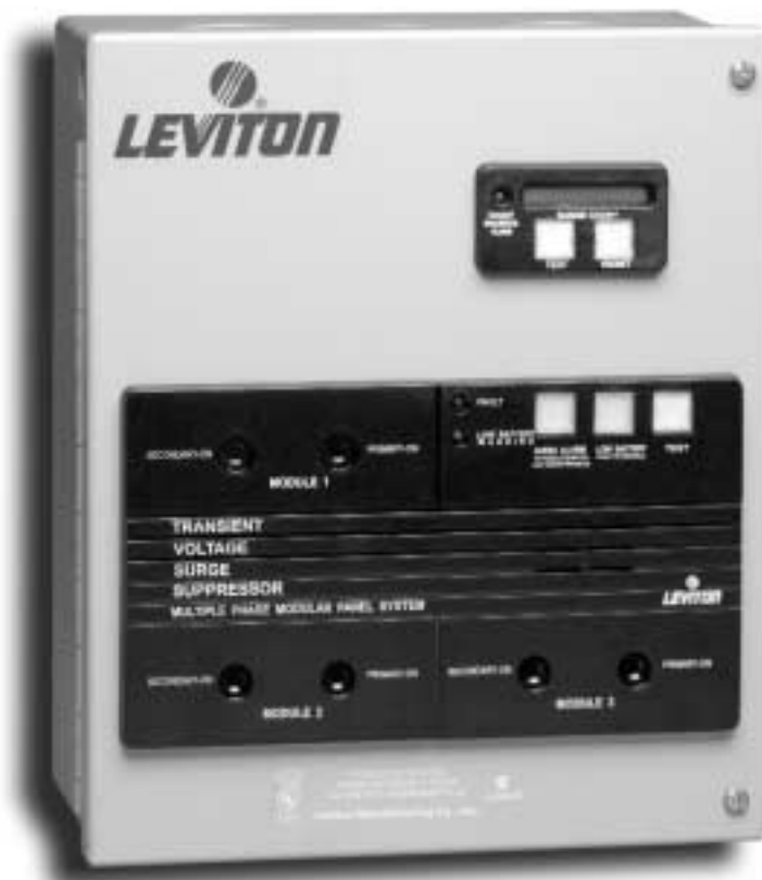
Cat. No. 57120-CM3

Cat. No. 57000 is designed for use where a multi-phase, transient voltage surge suppressor (TVSS) is specified. Its parallel-operated design features 40mm-diameter, metal-oxide varistors and EMI/RFI filter circuitry equipped with high-voltage-rise capacitors for harmonic tolerance. It features indicator lights, a status relay and an audible alarm for monitoring power and surge suppression, and replaceable modules that deliver redundant protection. The 57000 has been tested to ANSI/IEEE C62.45 standards for Category A, B and C environments and is UL 1449 (2nd Edition) Listed. It is also backed by Leviton's Limited Ten-Year Warranty.