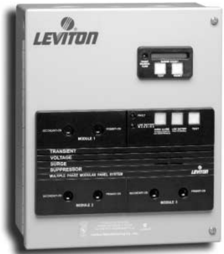
Cat. No. 57120-CM3

Cat. No. 57000 is designed for use where a multi-phase, transient voltage surge suppressor (TVSS) is specified. Its parallel-operated design features 40mm-diameter, metal-oxide varistors and EMI/RFI filter circuitry equipped with high-voltage-rise capacitors for harmonic tolerance. It features indicator lights, a status relay and an audible alarm for monitoring power and surge suppression, and replaceable modules that deliver redundant protection. The 57000 has been tested to ANSI/IEEE C62.45 standards for Category A, B and C environments and is UL 1449 (2nd Edition) Listed. It is also backed by Leviton's Limited Ten-Year Warranty.