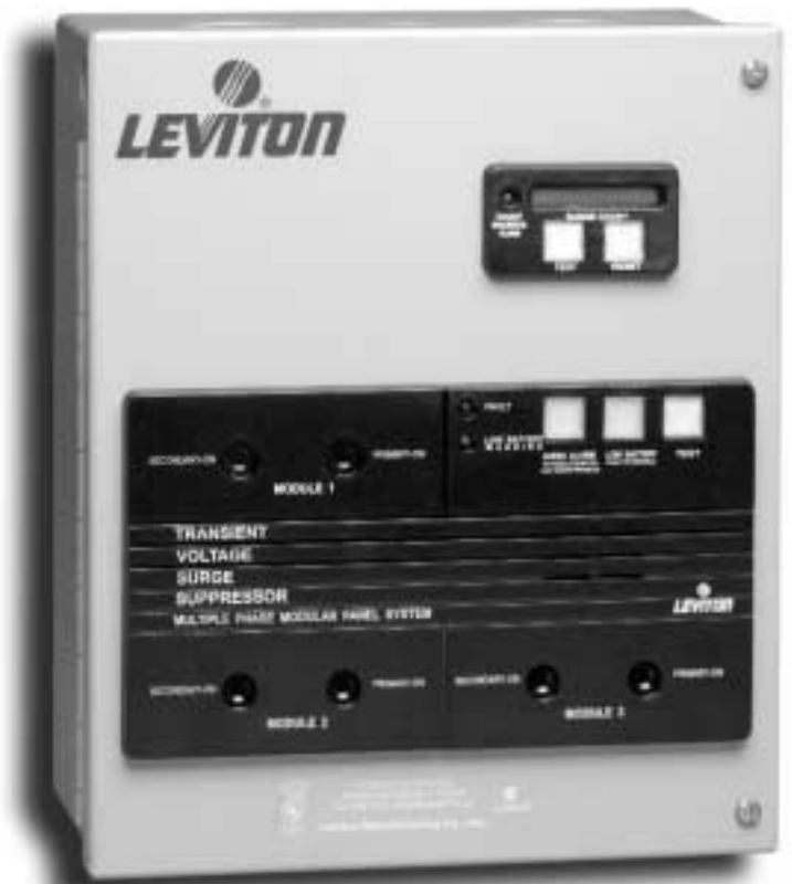
Cat. No. 57120-CM3

Cat. No. 57000 is designed for use where a multi-phase, transient voltage surge suppressor (TVSS) is specified. Its parallel-operated design features 40mm-diameter, metal-oxide varistors and EMI/RFI filter circuitry equipped with high-voltage-rise capacitors for harmonic tolerance. It features indicator lights, a status relay and an audible alarm for monitoring power and surge suppression, and replaceable modules that deliver redundant protection. The 57000 has been tested to ANSI/IEEE C62.45 standards for Category A, B and C environments and is UL 1449 (2nd Edition) Listed. It is also backed by Leviton's Limited Ten-Year Warranty.